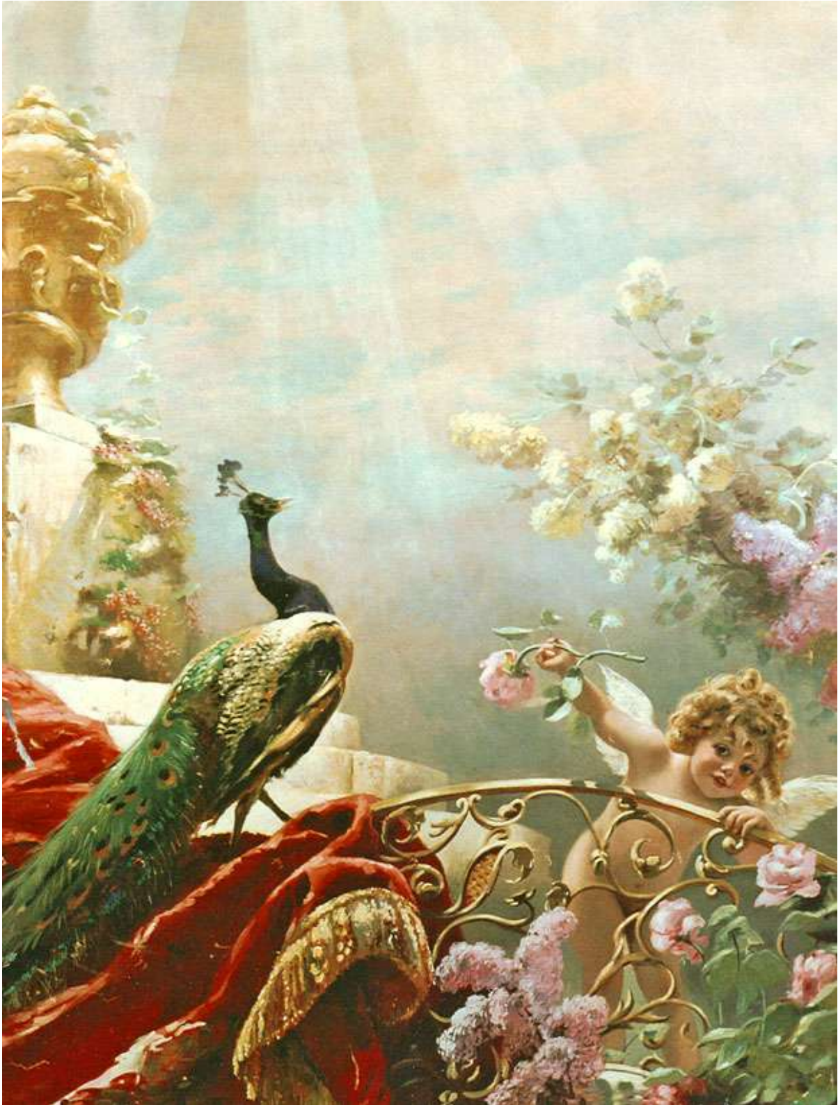
(Artist: Konstantin Makovsky Date: 1839-1915)