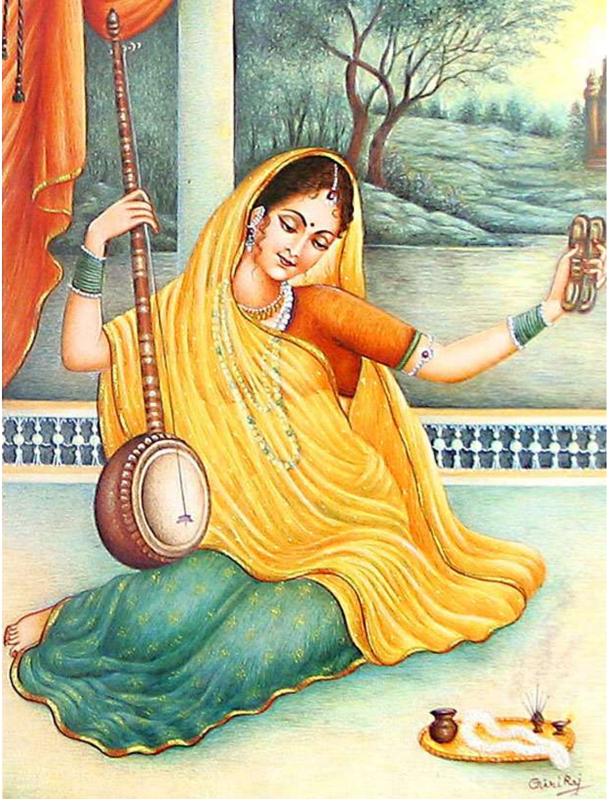
(Artist: Giri Raj )