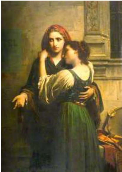
(Artist: Pierre Auguste Cot Date: 1837-83)

Why are you constantly deluded. Why do you grieve on account of thy helplessness. Why don't you see the lord almighty. Why don't you become freed from sorrow. Why do you experience the pleasant or painful fruits of thy past deeds. Why are you immersed in the sorrow of the world! O mortal!