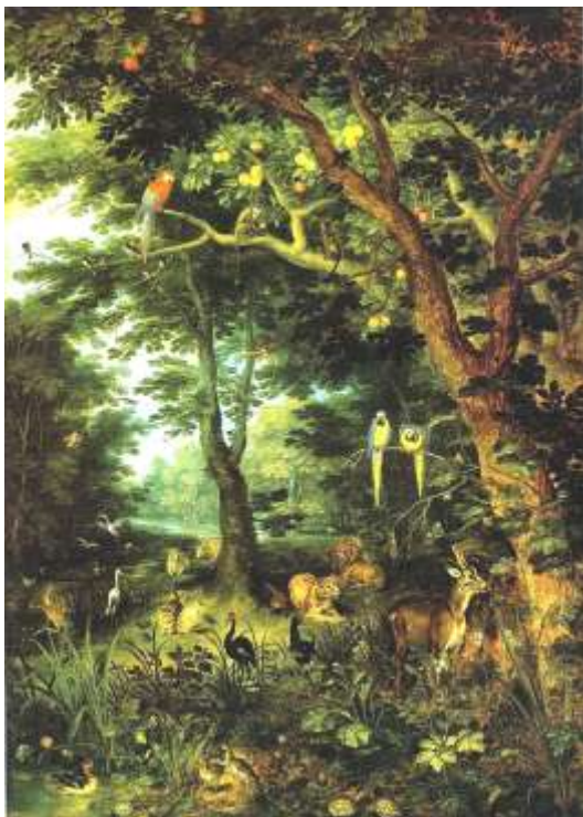
(Artist: Jan Brueghel the Younger Date: 1601-78)

In me are centered all things that moves.