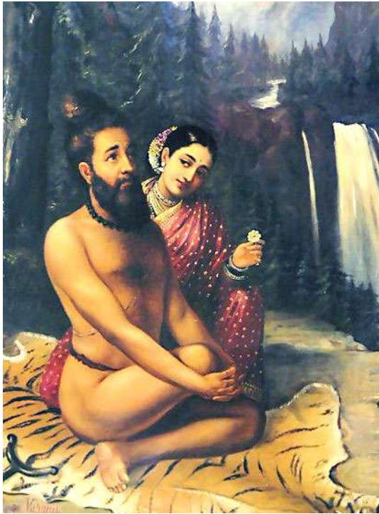
(Artist: Raja Ravi Varma Date: 1848-1906)

Do you know that supreme abode. Do you intend to pass beyond the seed of rebirth. Do you intend to pass beyond the material cause of embodied existence. Do you still entertain desires. Do you intend to be born again here and there on account of your desires. Do you intend to be the person who has his desires fully satisfied. Don't you know the worlds that shine brightly! O mortal!